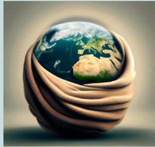
Earth wrapped in warm gas blankets

Voltazio continued, "These additional temperatures lead to serious issues. The ice at few places melt causing the waters rise and flood some areas. It plays with the weather, bringing on wild storms, heat waves, and in certain places, extremely frigid winters."