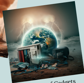
Radiation of Gadgets